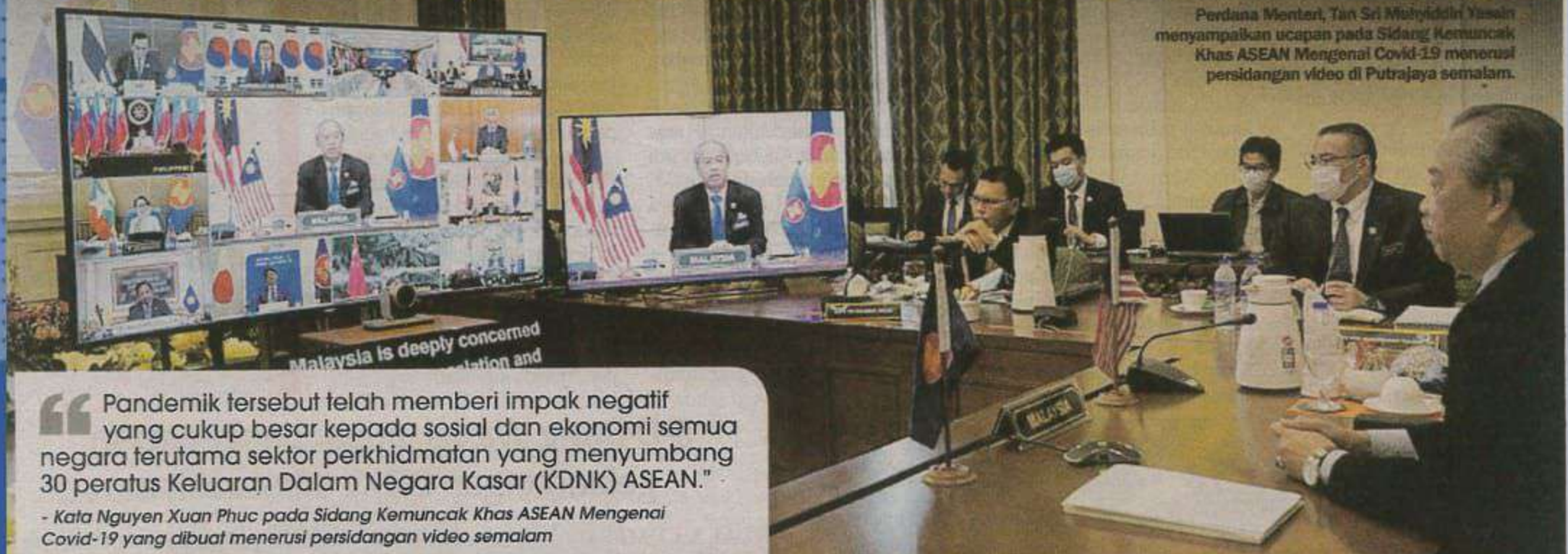
Perdana Menteri, Tan Sri Muhyiddin Yassin menyampaikan ucapan pada Sidang Kemuncak Khas ASEAN Mengenai Covid-19 menerusi persidangan video di Putrajaya semalam.

“Pandemik tersebut telah memberi impak negatif yang cukup besar kepada sosial dan ekonomi semua negara terutama sektor perkhidmatan yang menyumbang 30 peratus Keluaran Dalam Negara Kasar (KDNK) ASEAN.” - Kata Nguyen Xuan Phuc pada Sidang Kemuncak Khas ASEAN Mengenai Covid-19 yang dibuat menerusi persidangan video semalam