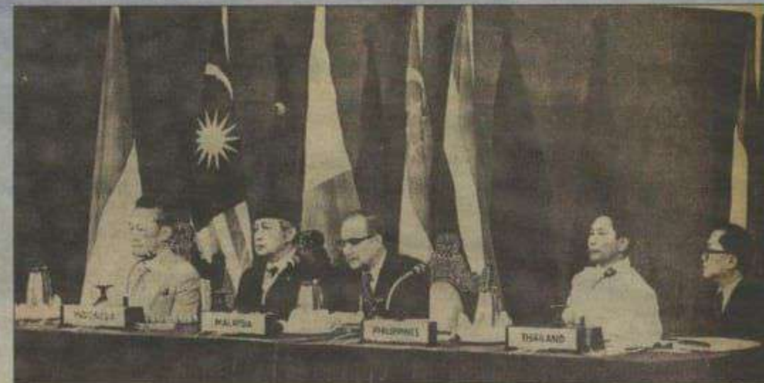
PERDANA Menteri Malaysia, Allahyarham Tun Hussein Onn (tiga dari kanan) selaku Pengerusi Sidang Kemuncak ASEAN Kedua menyampaikan ucapan beliau di Kuala Lumpur pada 4 Ogos 1977.