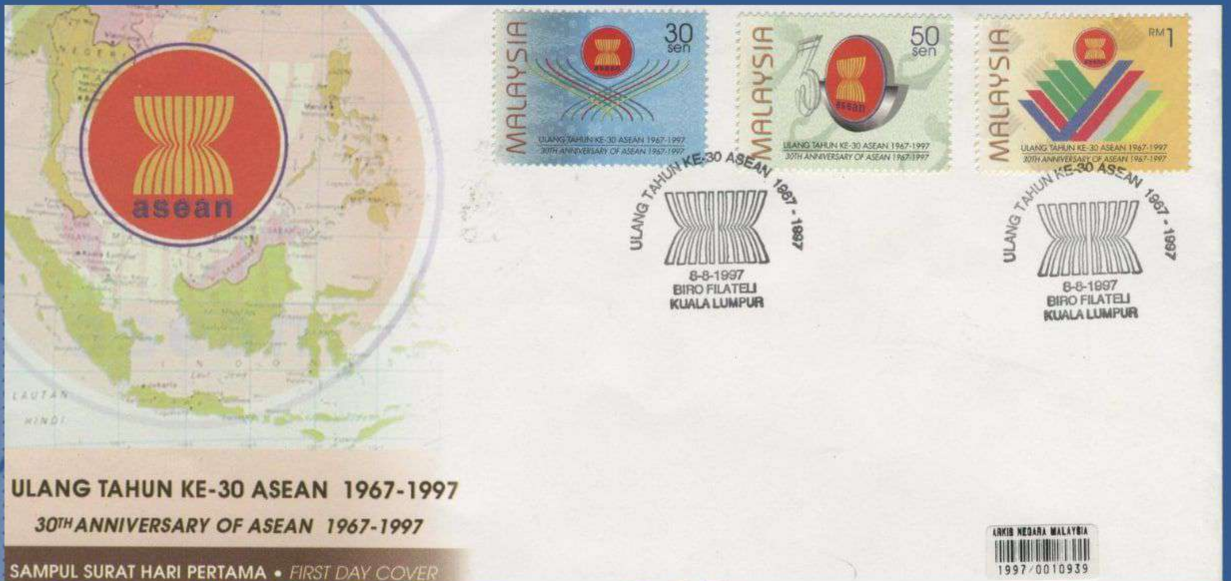
Sampul surat khas yang dikeluarkan oleh Pos Malaysia pada 8 ogos 1997 sempena memperingati ulangtahun ke-30 penubuhan ASEAN.