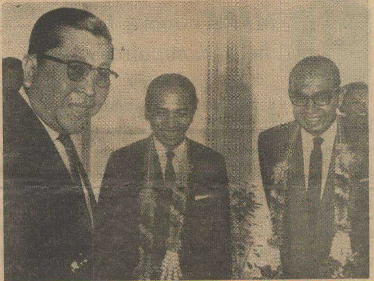
• DELEGATION leaders to the South-east Asian Association for Regional Cooperation at Don Muang airport, Bangkok. From left Thai Foreign Minister Tun Thanat Khoman, Indonesian Foreign Minister, Mr. Adam Malik, and Malaysian Deputy Prime Minister Tun Abdul Razak.

He also declared he would personally welcome Cambodia to the new grouping if she wanted to join even though Thailand had no diplomatic relations with her.