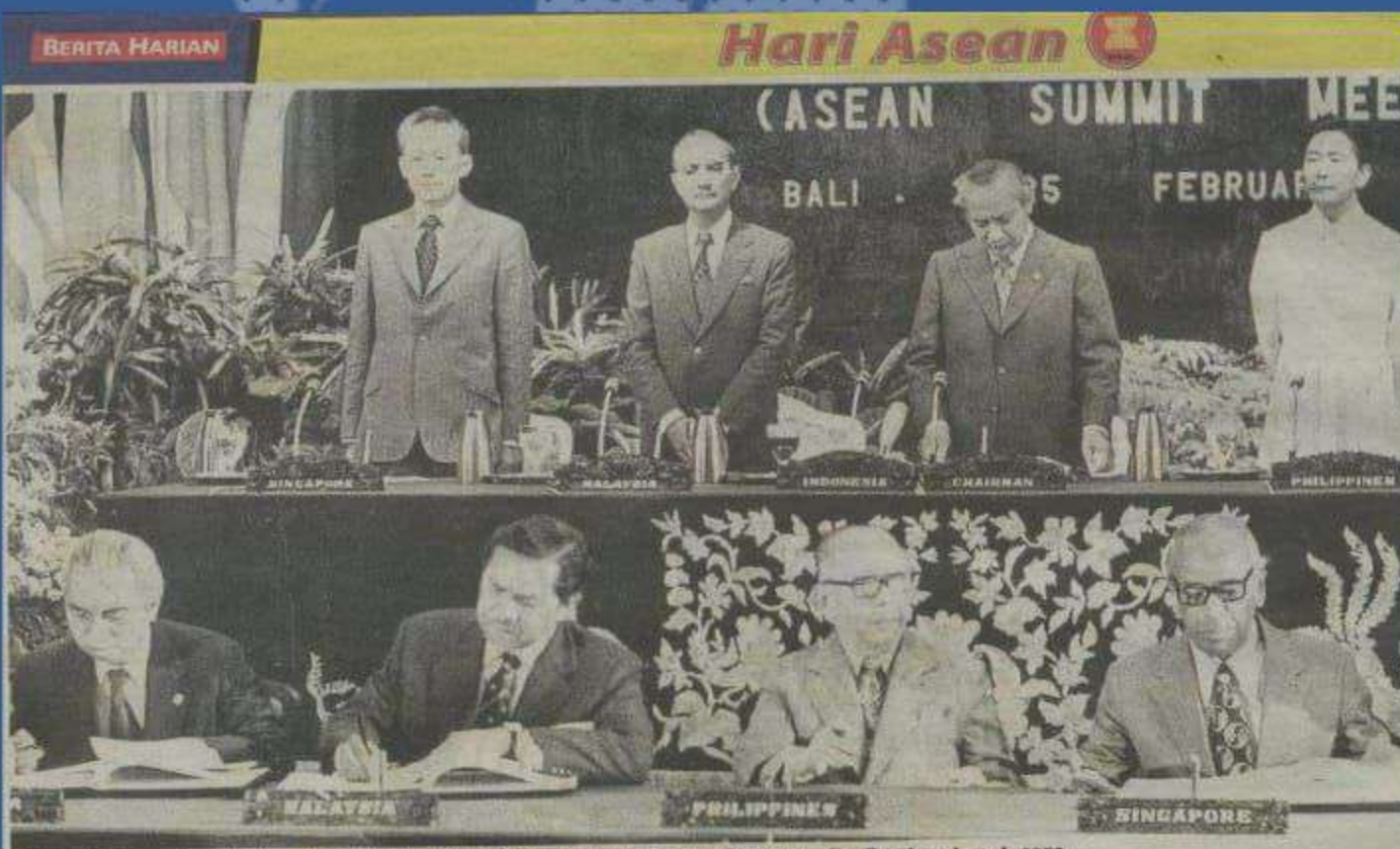
BERSATU: Mesyuarat yang berlangsung membincangkan pelbagai isu mengenai negara anggota di Bali, Indonesia pada 1976.

Deklarasi Kuala Lumpur berkenaan Sidang Kemuncak ASEAN + 3 yang ditandatangani pada tahun 2005 telah mengesahkan komitmen Jepun, Republik Korea dan China untuk merealisasikan matlamat jangka panjang Masyarakat Asia Timur iaitu untuk menyumbang kepada keamanan, keselamatan, kemakmuran dan kemajuan serantau dan seluruh dunia.