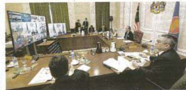
Muhyiddin menyampaikan ucapan pada Sidang Kemuncak Khas ASEAN Mengenai Covid-19 menerusi persidangan video di Perdana Putra, Putrajaya semalam.

Malaysia mencadangkan ASEAN merangka Pelan Pemulihan Ekonomi Pasca-Covid-19 bagi memberi tumpuan kepada aspek kewangan, jaringan keselamatan sosial, jaminan makanan dan pendidikan demi kepentingan penduduk di rantau ini.